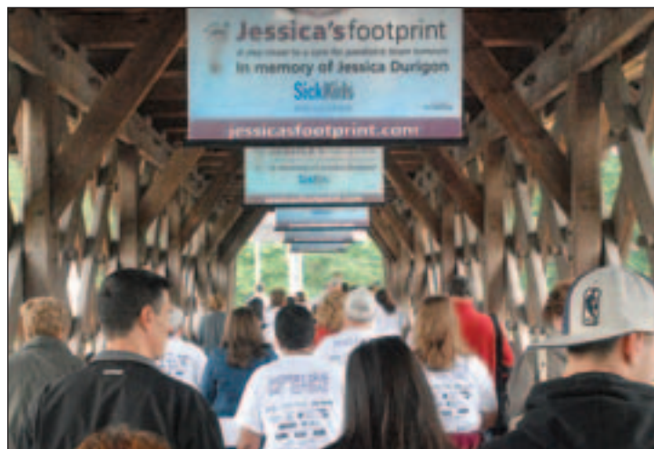
An estimated 1,100 walkers raised $170,000 for the Sick Kids Foundation at the Jessica's Footprint — A Walk in the Park in Guelph Saturday, easily surpassing the hoped-for amount of $140,000.